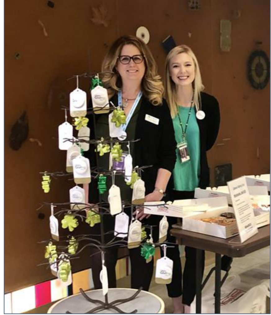
KCLSF staff, doughnuts, and our Giving Tree